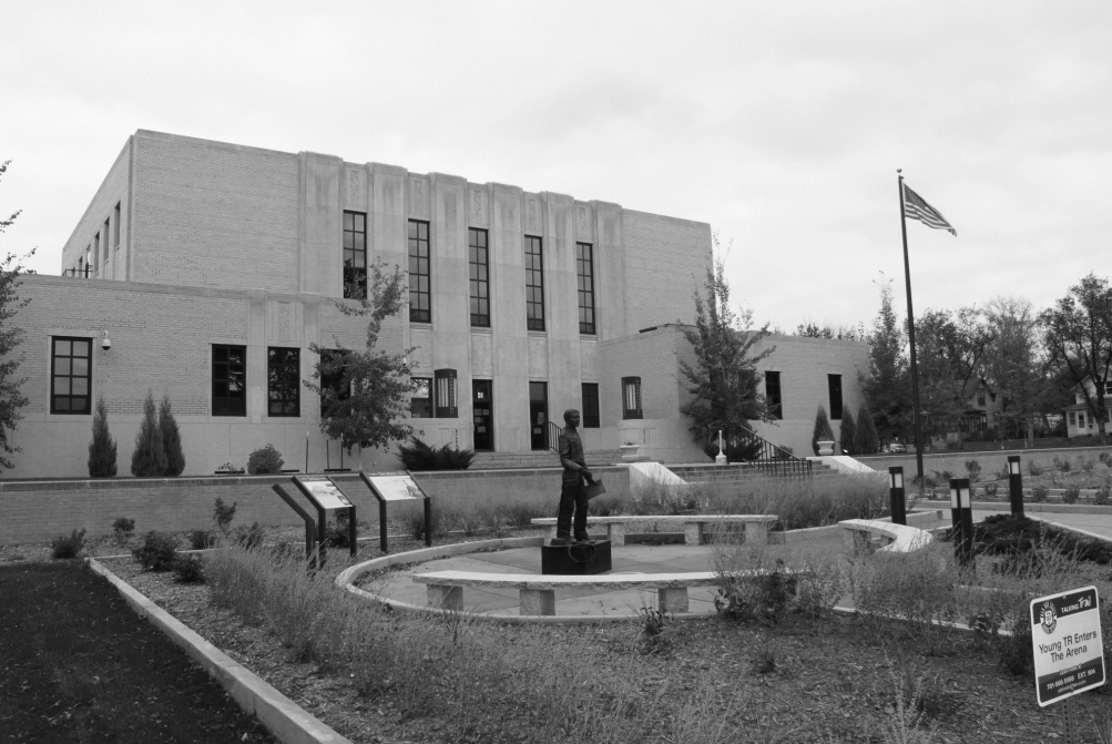
Stark County Courthouse, Dickinson